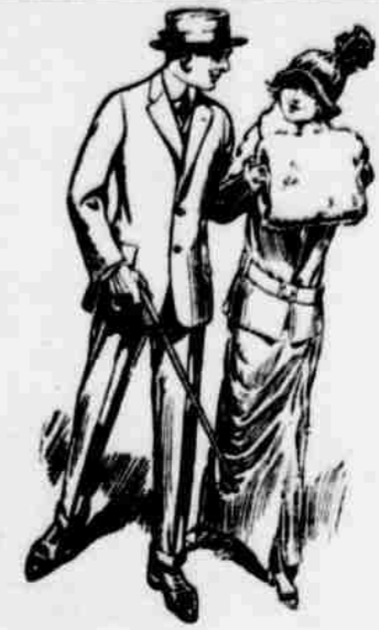
BRANDEGEE KINCAID & CO. CLOTHES

I never have to apologize for being a prohibitionist. I dare say there can hardly be found in this splendid county a teacher in your public schools who would be re-elected to his position if his trustee knew that he was a pronounced anti prohibitionist. Even our anti friends want better examples set before their children than they sometimes set. I venture to say just here that there is not a Missionary Baptist in Haskell county who would send his son or daughter to Simmons College if that one knew that the president of Simmons College were an anti. Am I not correct about this? I trust none of my anti-Baptist brethren will find fault with my position or what I say. I am not claiming that I am any better than you are. I am simply contending that you set one standard for yourself and one for your school teacher. And I can prove by your own pastor that my standard is the one that he would have you conform to. Furthermore, my friends, the president of Simmons College is in better standing in his church than any anti-prohibition Baptist is in his church. I do not