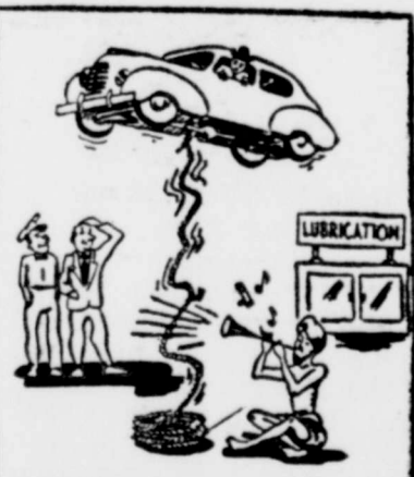
"Use him when the grease lift is broken"

We DO go all out to give service, but nothing magical about it. We know how and it is our pleasure to do a BETTER job everytime.