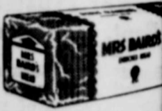
STAYS FRESH LONGER

Your cookbooks keep fresh clean looks if remember this stunt. opening the book to recipe you're using, place glass pie plate over the page. It protects the page splatters and accidents. And happily for eyes, the glass plate also magnifies the printing. Recipes easier to read!