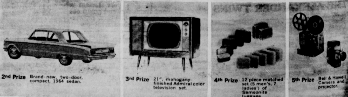
2nd Prize Brand-new, two-door, compact, 1964 sedan.