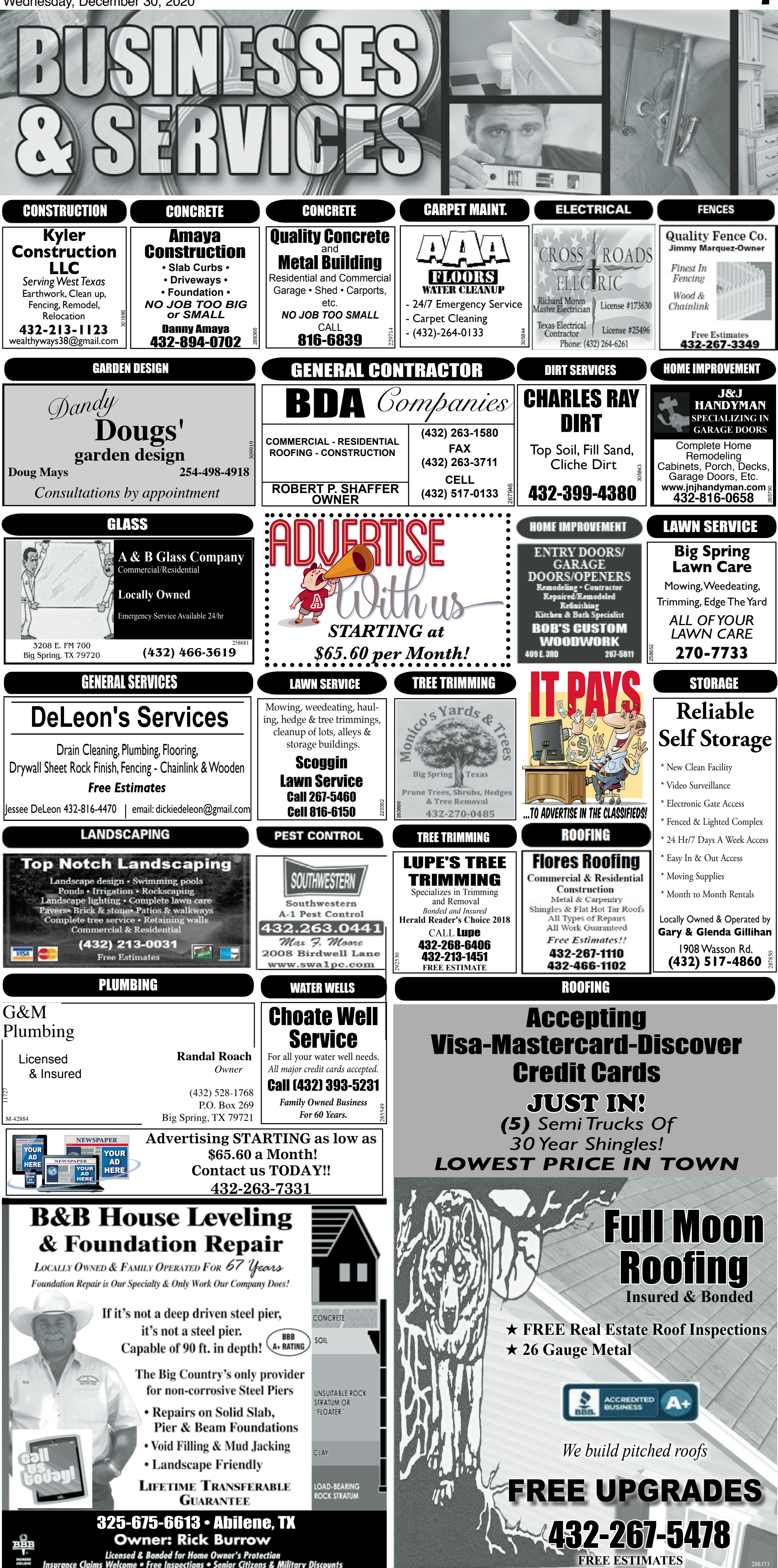
BIG SPRING HERALD Wednesday, December 30, 2020