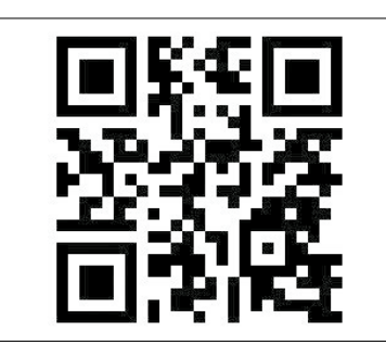
Find us online at: www.bigspringherald.com