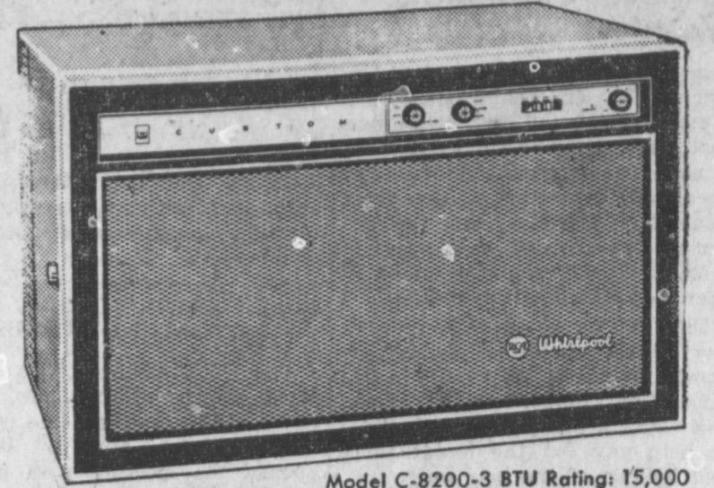
Model C-8200-3 BTU Rating: 15,000