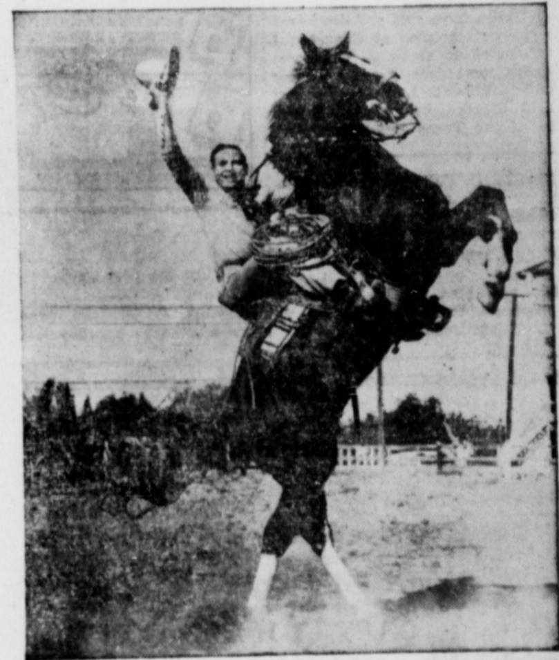
Gene Autry and his famed horse "Champion", shown here, will be featured at the Houston Fat Stock Show and Rodeo, January 29 through February 9.