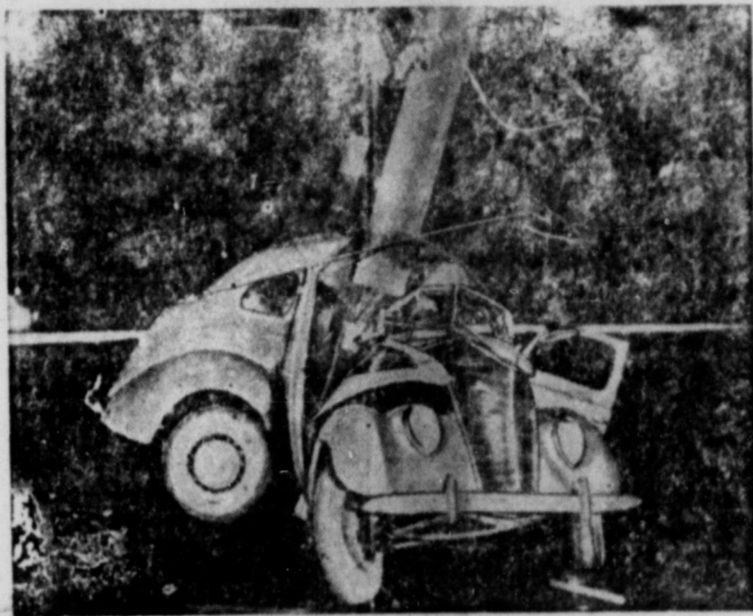
Speeding through the night, the driver of this car was momentarily blinded by approaching headlights. Because he was going too fast to control his car instantly, he swerved off the highway and crashed into a telegraph pole with such force that the car was almost broken in two. He was dead when help arrived. National Conservation Bureau advises night-drivers to keep their eyes focused on the side of the road, never to look directly into headlights and—most important of all—to drive at moderate speed.