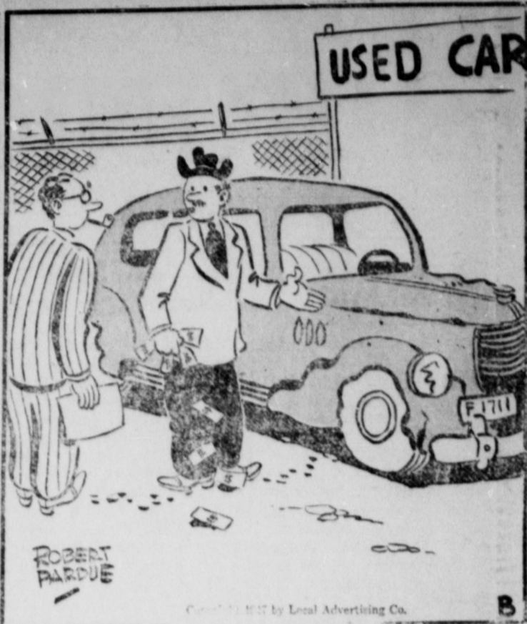
"I don't care how it looks if it has been overhauled by MASON CHEVROLET COMPANY."

Cotton sunbacks are the girls' first choice for summertime, the fashion experts report. They serve double duty because when topped by a jacket or bolero, they're suitable for the business world. Without the jacket, they're just right for play in the sun. Clifford of del Mar uses pincheck and plaid cotton for his interpretation of the versatile sunback style, the National Cotton Council reports.