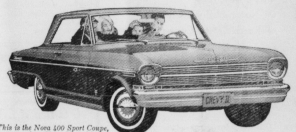
This is the Nova 400 Sport Coupe, just one of 11 Chevy II models you can pick from.

The men who know cars best put Chevy II to the test. And, after they had compared it with the rest of the '62 crop, the editors of Car Life magazine picked Chevy II for their coveted Engineering Excellence Award. Why? Here are some of the reasons in the editors' own words: "The Chevy II, in either 4- or 6-cylinder form, represents an important development in the American automotive field. The car is maximum transportation at minimum cost..." And throughout the editors' reports on the engineering and road testing you'll find accolades like "easy maintenance"... "long wearing ruggedness"... "simple elegance"... "reasonable size"... "delightful car to drive." Get the full story in the February issue of Car Life . Better yet, see your Chevrolet dealer. See for yourself why luxury and low price have never been more beautifully blended!