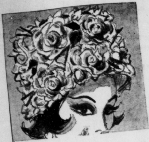
Roses that bloom in the snow...