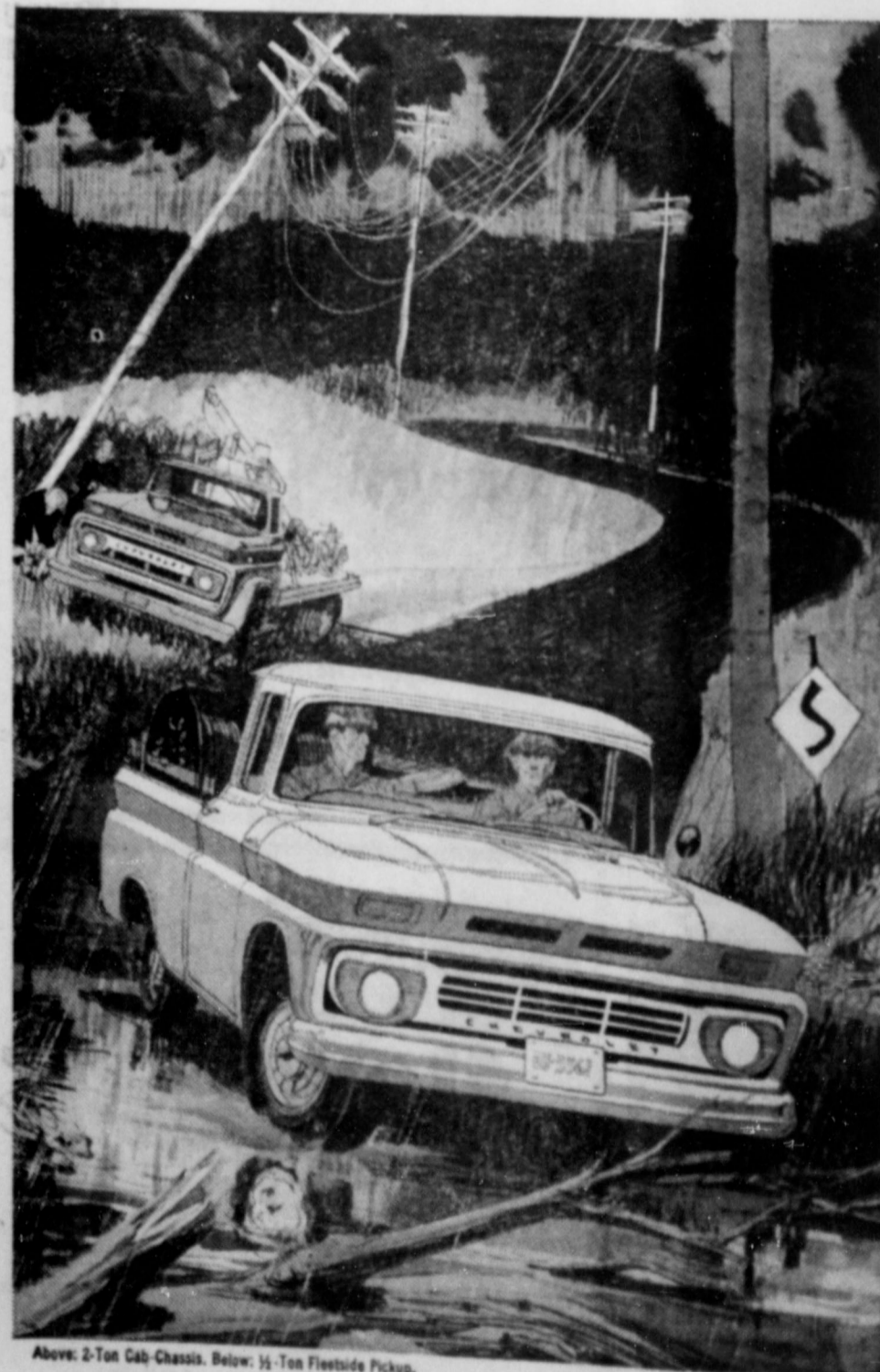
Above: 2-Ton Cab Chassis. Below: 1 1/2-Ton Fleetside Pickup.

AS LOW AS $6 28 PER MONTH FREE NORMAL INSTALLATION