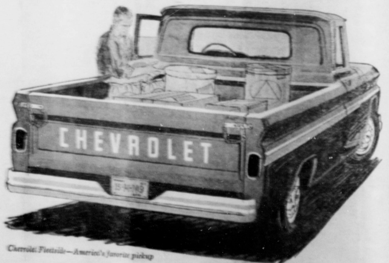
Chevrolet Fleetside—America's favorite pickup

If you wish you had a truck that cost you less thought and attention, put your money on quality. Make your next buy a dependable Chevrolet truck.