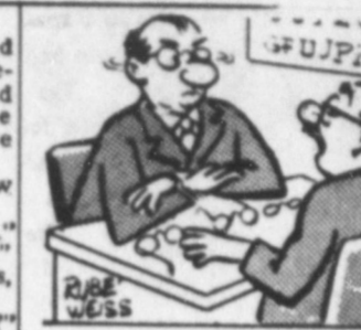
"The glasses are straight, all right -- it's your head that's crooked!"

American: "Do you allow your boys to smoke?" Eton master: "I'm afraid not." American: "Can they drink?" Eton master: "Good gracious, no." American: "What about dates?" Eton master: "Certainly, as long as they don't eat too many."