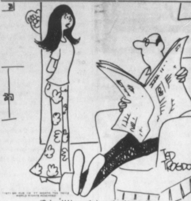
"Dad, could I borrow the key to the refrigerator?"

A London newspaper published the following conversation between a visiting American and an Eton school master, with the usual assurances of its absolute truth: