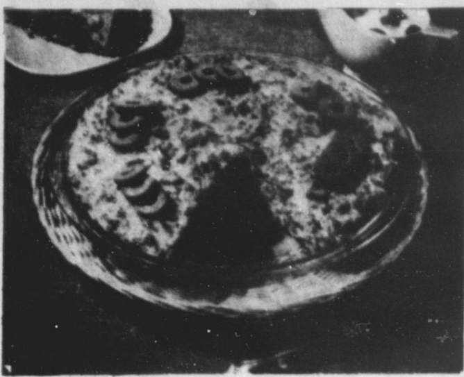
Salmon - Rice Pie

1 can (1 lb.) salmon, flaked 2 cups hot, cooked rice 2 tablespoons minced parsley 1 tablespoon finely cut onion 1/2 cup chopped celery 2 tablespoons lemon juice 1 1/2 teaspoons salt 1/4 teaspoon pepper 3 eggs, well beaten Combine salmon with rice.