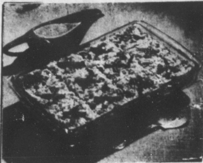
Fluffy Chicken Loaf

Don't forget this is to be one week only; so have your extra trash out where we can get it on June 5 through June 10. Mayor Lewis