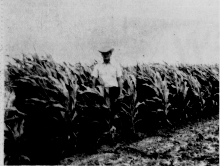
BEEF BUILDER -- Jerry Oswalt in a field of Beef Builder. He has 200 acres of this planted on diverted land from the cotton and grain programs. It will be used for grazing live-