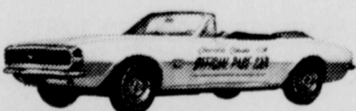
CAMARO CHOSEN 1967 INDIANAPOLIS 500 PACE CAR

Now, during the sale, the special hood stripe and floor-mounted shift for the 3-speed transmission are available at no extra cost! See your Chevrolet dealer now and save!