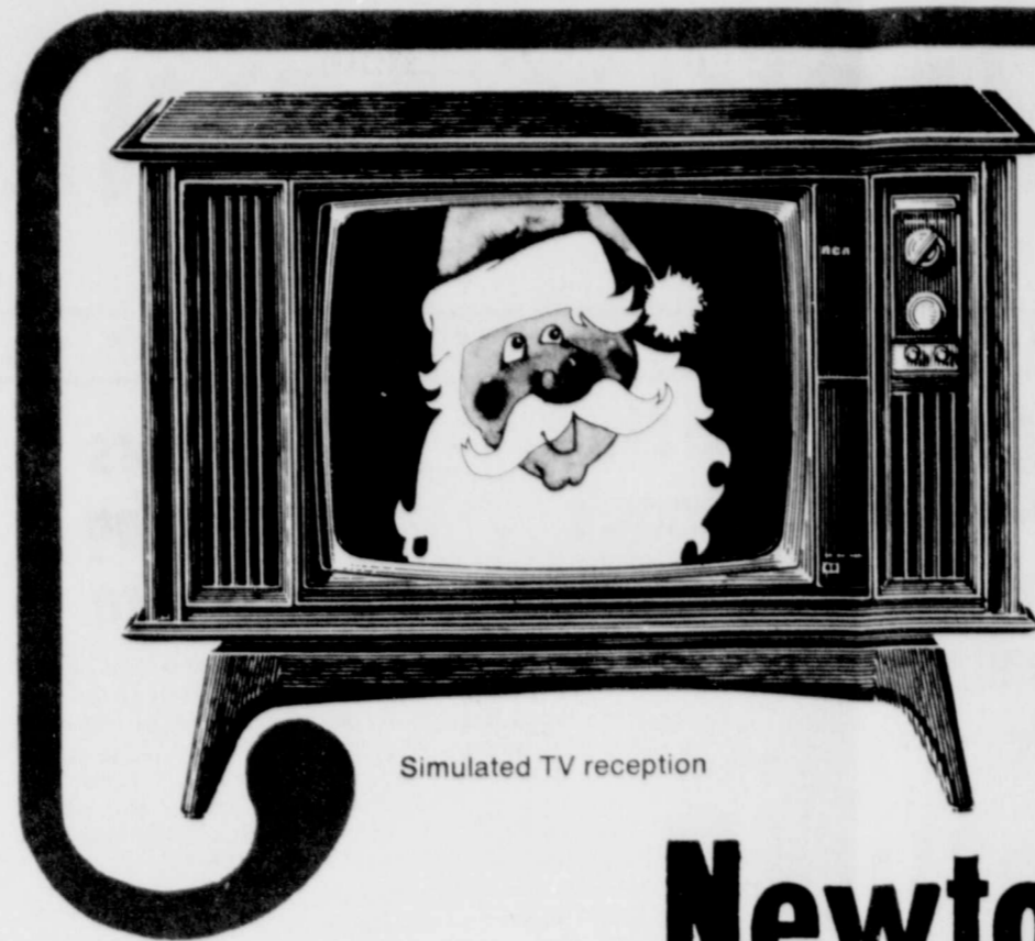
Simulated TV reception

-tip- While the Johnsons were still in the White House, Lady Bird gave a luncheon there. One of the guests was entertainer Ertha Kitt, who tossed a tirade of