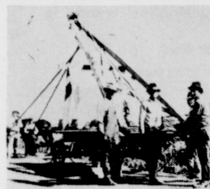
50 years ago, the year Southwestern Public Service Company was born, raising transmission poles was, literally, a matter of horse and man power as pictured above. In the company's golden anniversary year, it's just a question of lift, set and tamp, as seen at right, nearly all of it done mechanically.

The fusion process for making electricity will require ionized gases at temperatures of millions of degrees. These ionized gases - they're known as plasma - may be used as a fusion torch to vaporize waste materials of all kinds, turning them into electrified particles