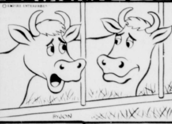
"I HATE THE THOUGHT OF WINTER AND THOSE COLD HANDS!"

It's Time To Winterize. See Us For Permanent-Type Anti-Freeze. Also, for All-Weather mud & snow Tires. LPG delivered to the tank at your home. Radio-dispatched delivery trucks for FAST Service. We'll Help Keep Your Home Warm.