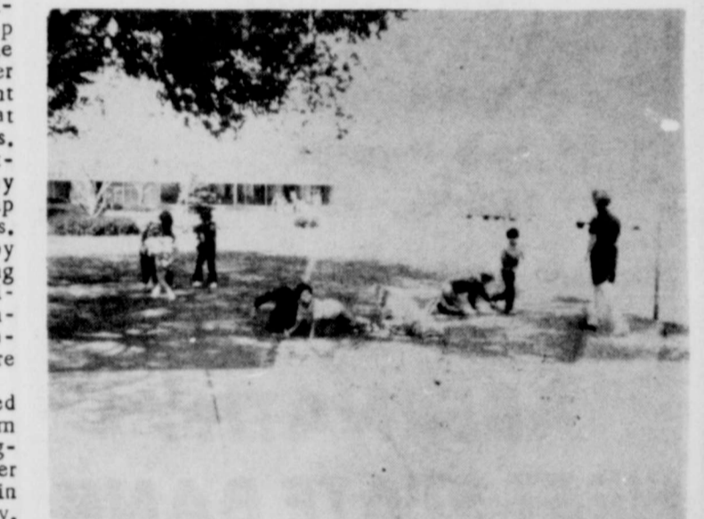
SCOUTS Cleaning around post office and city hall.