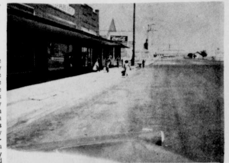
SCOUTS Cleaning Main Street in Abernathy.