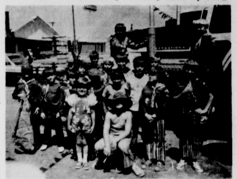
CUB SCOUT Pack 481 and BOY SCOUT Pack 481 participate in Clean-Up Drive in city.