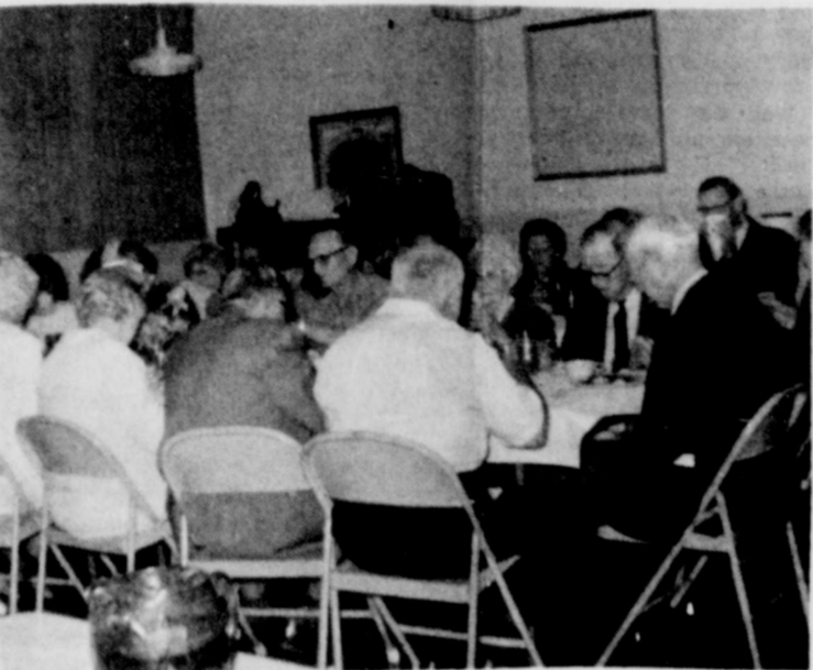
THIS PHOTO was made in the City Hall club room during the April meeting of the Sunshine Group. It shows the group during the luncheon held in connection with the meeting.