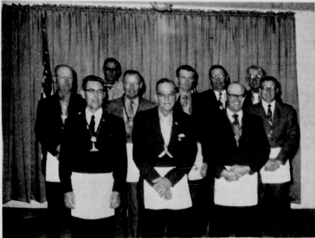
MASONS Install Officers Here—The men pictured here were installed as officers of Abernathy Lodge No. 1142, A. F. & A. M., in an open ceremony at the Lodge Hall the night of July 7.