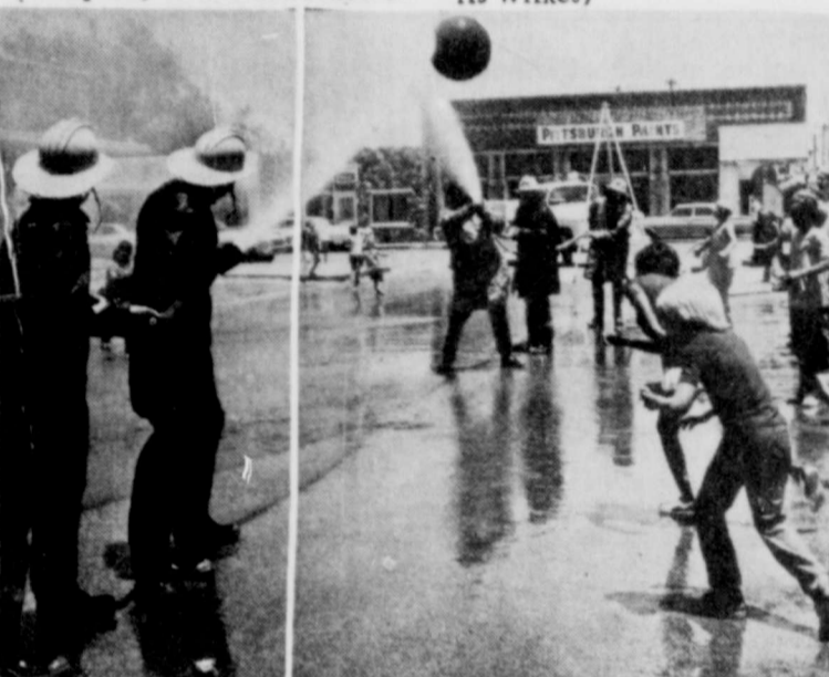
WET AND WILD...Abernathy firemen battle in a game of Water Polo during the Independence Celebration, July 1. The and a great number of nieces and nephews.