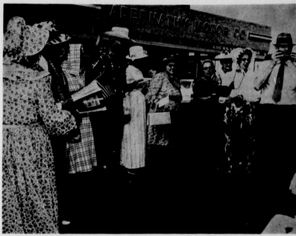
Members of the Sunshine Club sing in downtown Abernathy after the parade on the Independence Day Celebration, July 1.