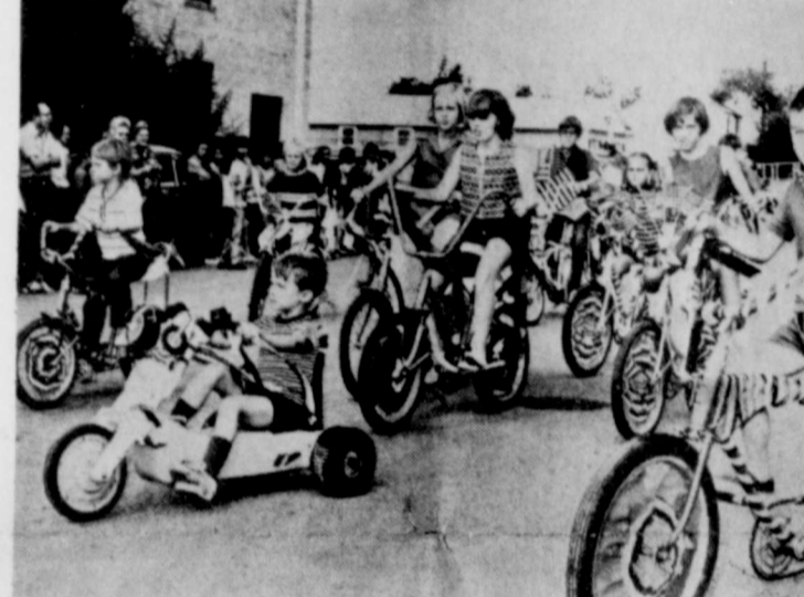
Youngsters of all ages ride colorfully decorated bicycles through the streets of Abernathy