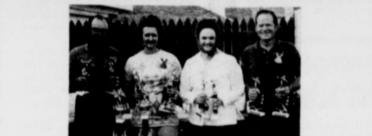
(Editor's Note: The photo and caption are from The Southwestern magazine of Southwestern Public Service Company. The two couples, of Amarillo, formerly of Abernathy, are longtime bowlers, bowling in Lubbock and in Abernathy before going to Amarillo. They bowled in the 1972 Southwestern Public Service Co. League at