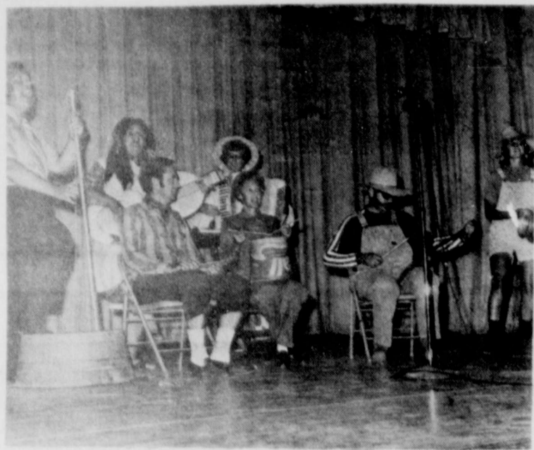
"We like Mountain Music"... Members of the Abernathy Classroom Teachers Association provide a bit of the "HEE