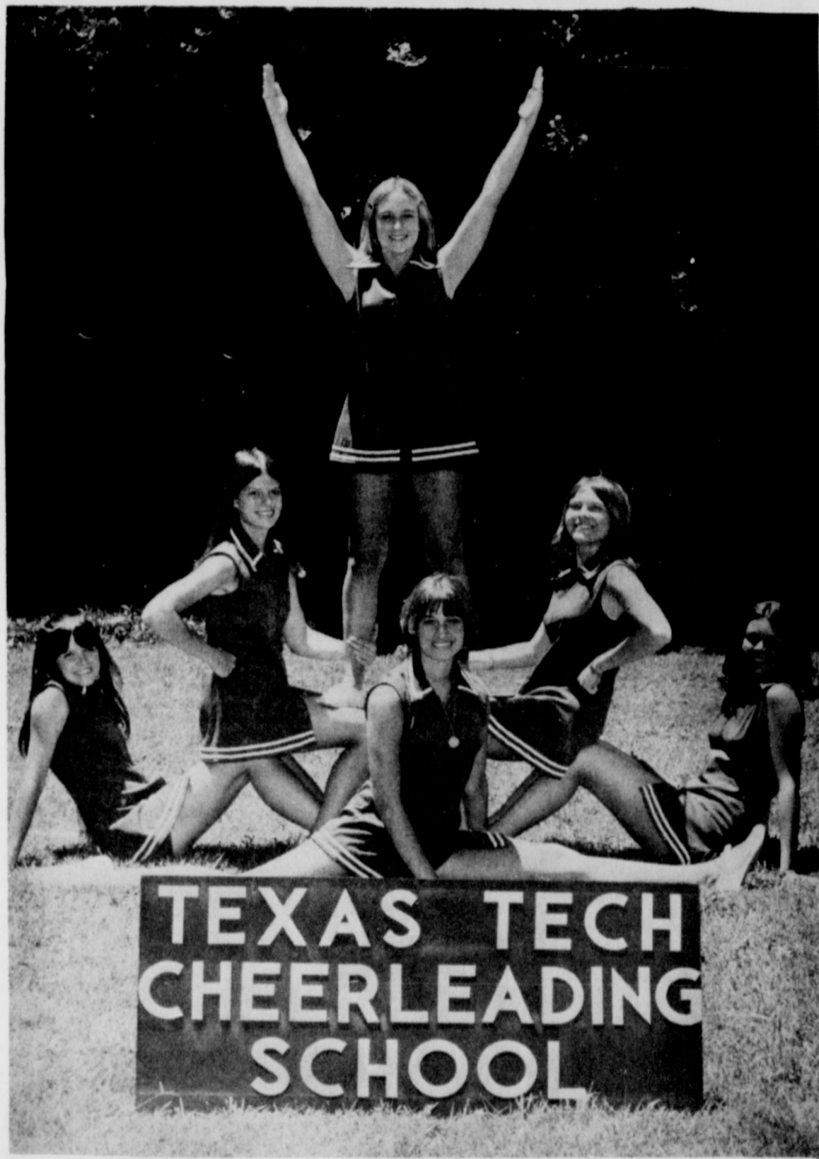
TEXAS TECH CHEERLEADING SCHOOL