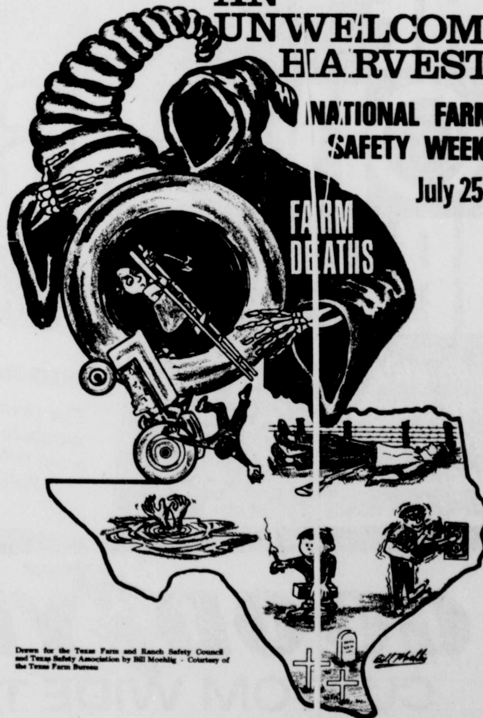
Drawn for the Texas Farm and Ranch Safety Council and Texas Safety Association by Bill Mowbray