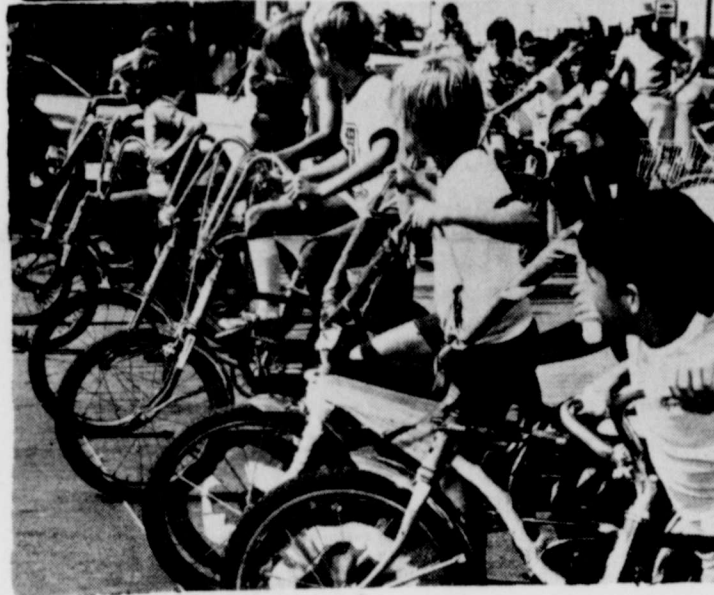
"On your mark, get set..." Race participants get ready for the start of the bicycle races at the July 1st Celebration.