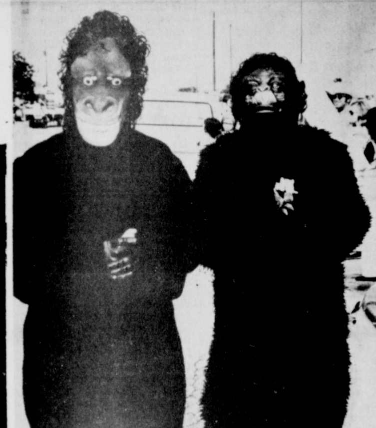
DON'T FEED THE MONKEYS... There was a little 'monkey business' going on during the Independence Day Parade on July 1.