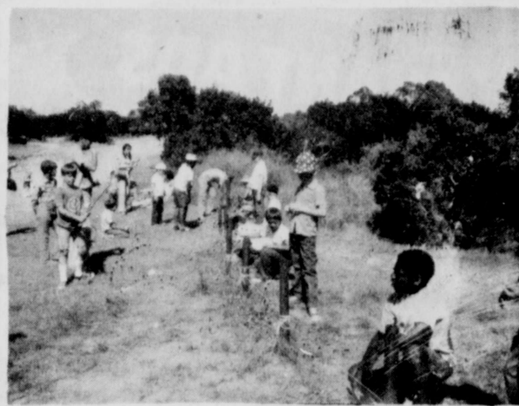
String Burning Contest and won second place for Pack 481.