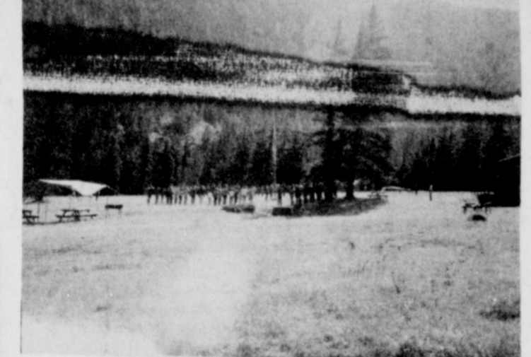
This was one of the flag ceremonies at Tres Ritos when all scout troops took part in every day.