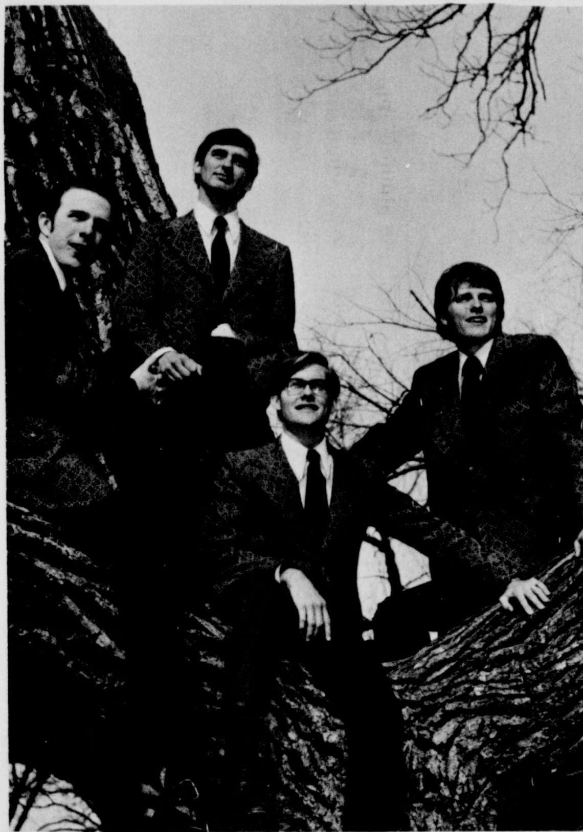
THE KING'S MEN TO APPEAR JULY 31

The King's Men Quartet, student representatives of Bethany Nazarene College, Bethany, Oklahoma, will appear at the Church of the Nazarene, 6th Street at Ave. E on Monday, July 31, 1972, at 7:30 p.m.