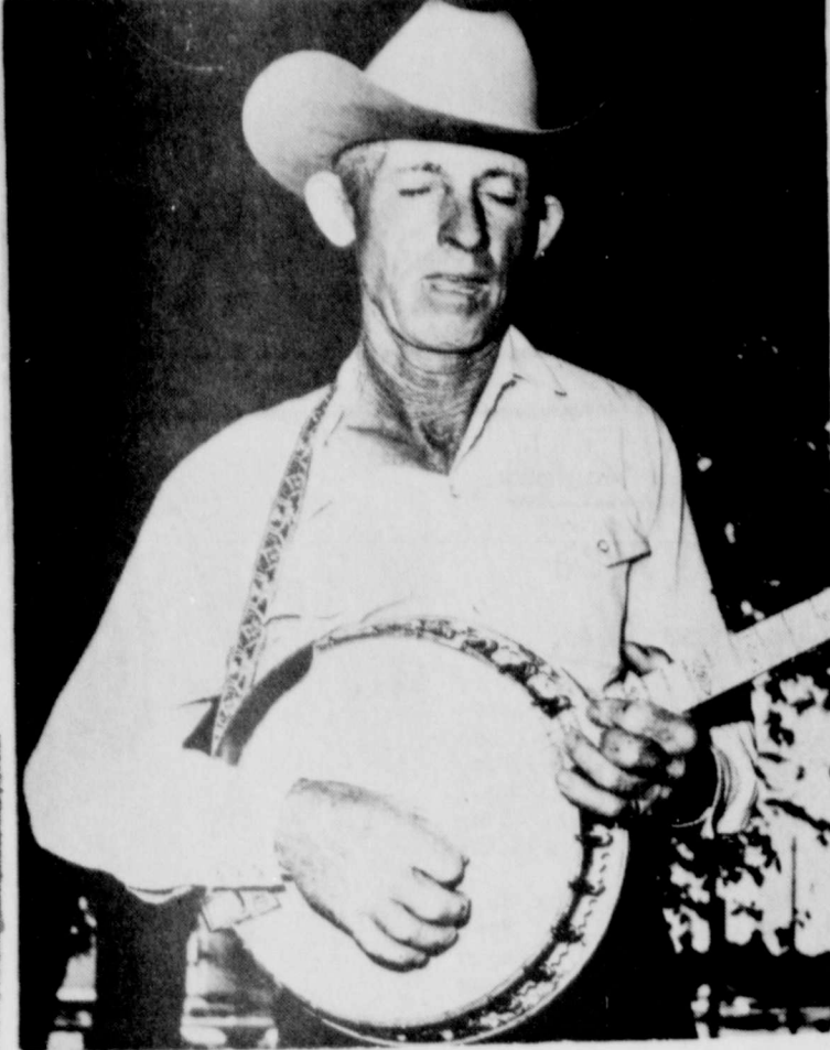
Not all of the music at the Old Fiddlers Contest, July 1, was PHOTO'S