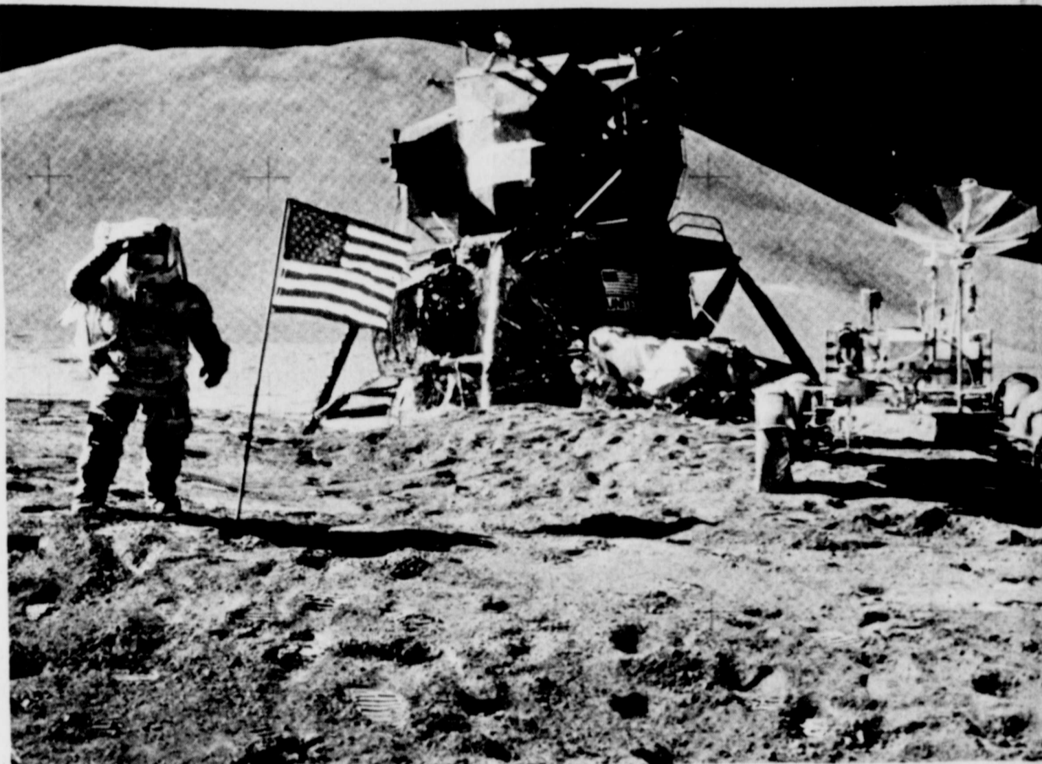
Astronaut Irwin Salutes The Flag at Apollo 15 Hadley-Apennine Landing Site