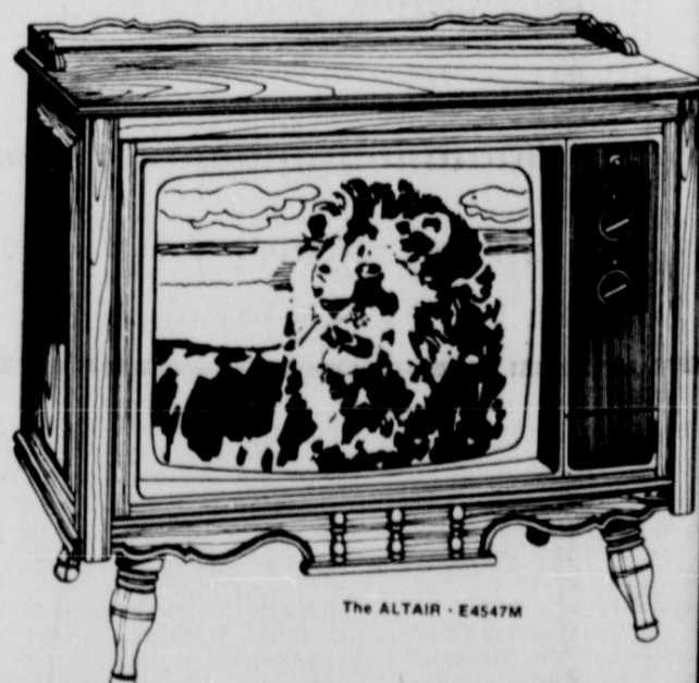
THE ALTAIR - E4547M