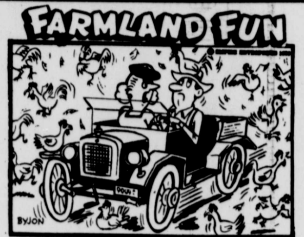
Do you always have to make a short cut through the woods to get to your farm?