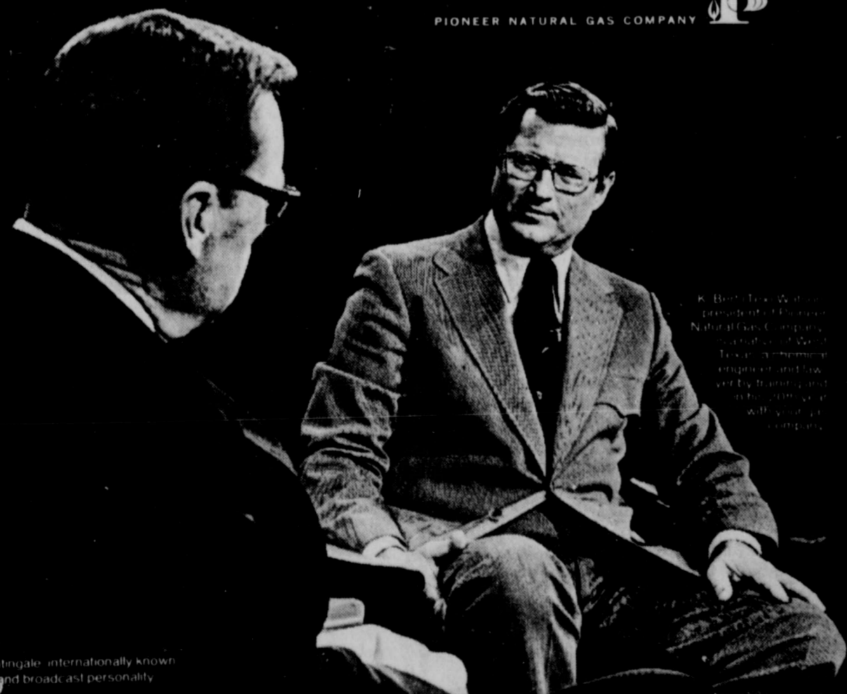
Earl Nightingale, internationally known lecturer and broadcast personality.