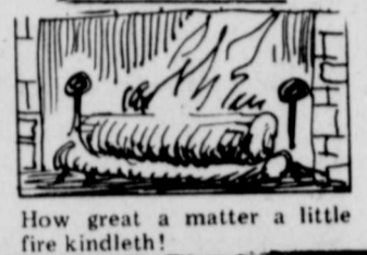
How great a matter a little fire kindleth!

Parents of the Baptist seniors served the dinner.