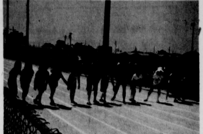
ON YOUR MARK--Fifth grade girls in the Elementary Junior Olympiad held here Friday prepare for their track events as the meet begins to get underway.

Thy word is a lamp unto my feet, and a light unto my path. (Psa. 119:105)