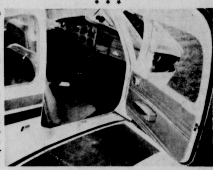
CRASH SITE--Shown here are pictures of the plane which crashed late Tuesday evening at Abernathy Airport, four miles west of Abernathy.

According to reports, the wires which were broken and knocked down had only last week been installed. The plane came in under the lines, which are located on the south side of the pavement, then bounced and skidded another 30 feet before coming to a halt. The front wheel was broken off upon impact, and the right wing wheel was doubled under the wing.