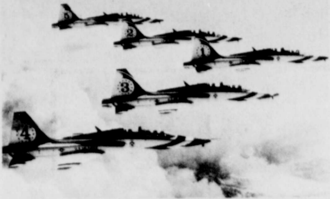
THE THUNDERBIRD WEDGE -- Seen from Thunderbird 6, wings its way to one of a hundred showsties flown annually by the team. The Thunderbirds will be a highlight of a public open house, September 24 between the hours of 1:00 and 6:30 p.m., at Reese Air Force Base. The event will honor the 25th Anniversary of Reese's continuous active service as an Air Force Base and the designation of the Air Force as a separate service on September 18, 1947, it was recently announced by Colonel Edward Mendel, Commander of the base's 64th Flying Training Wing.