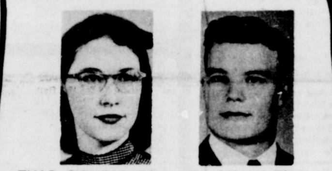
THIS COUPLE Plans To Attend The Abernathy Ex-Students' and Ex-Teachers' Reunion, July 3, 1976, WON'T YOU?