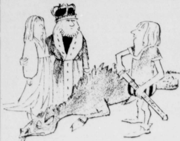
"Never mind your daughter's band... just give me a check from"