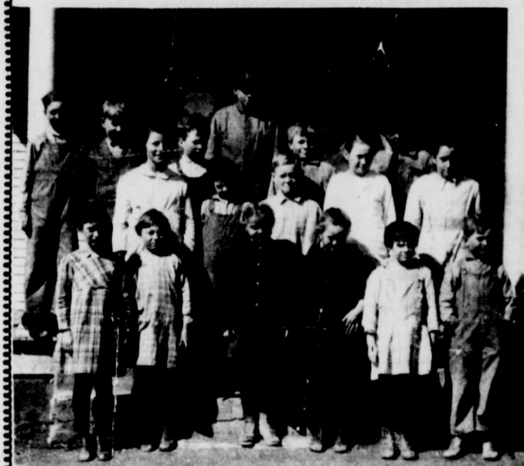
Shown above are a group of school students in the lower grades at County Line School in 1917. This building was built about 1916 or 1917 and replaced the one room