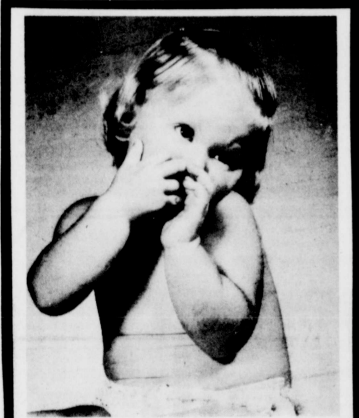
"MAY I HAVE IT ALL IN DIMES PLEASE?"