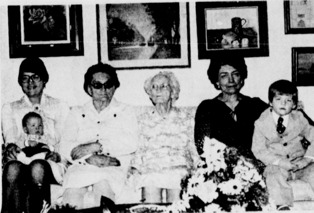
(Five generations from three months to 100 years old)