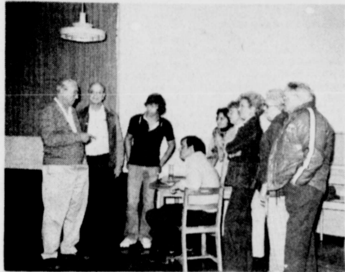
Building Improvements Steering Committee