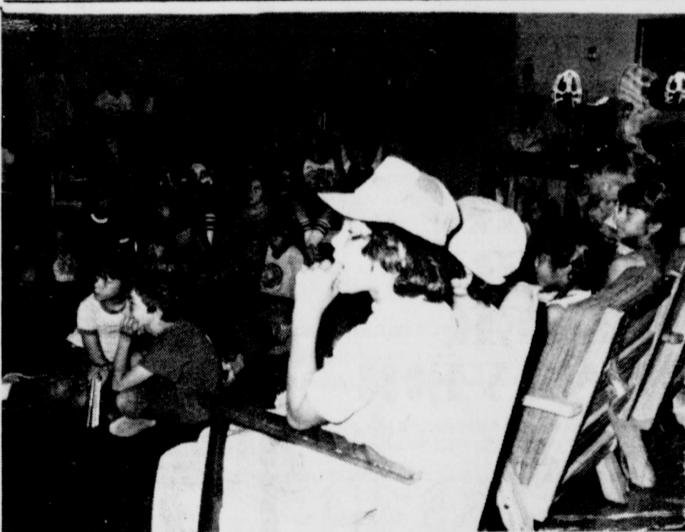
RAPT ATTENTION - The first summer movie of the year, sponsored by Abernathy Public Library, attracted 62 kids. The movies are each Friday afternoon at 2:30 in the City Hall Club Room.