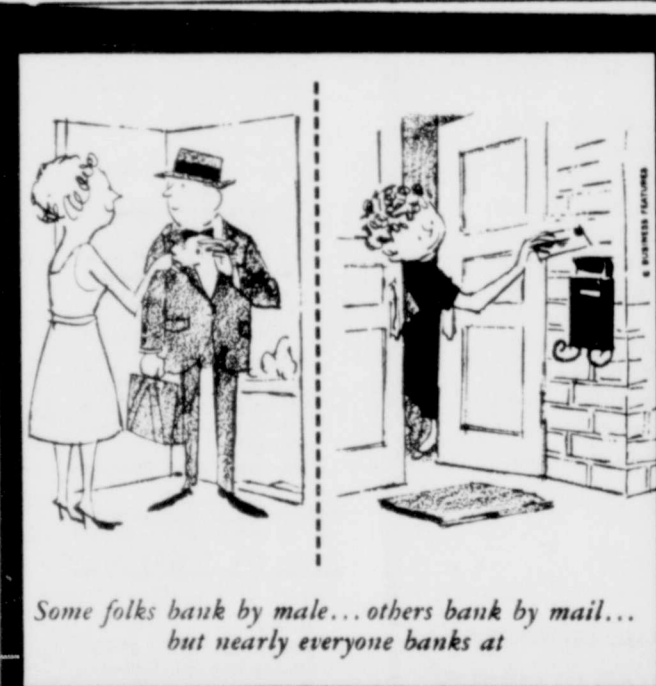
Some folks bank by male... others bank by mail... but nearly everyone banks at

871 Avenue E Abernathy, Texas 79311 residence: 298-2443 office: 298-2569