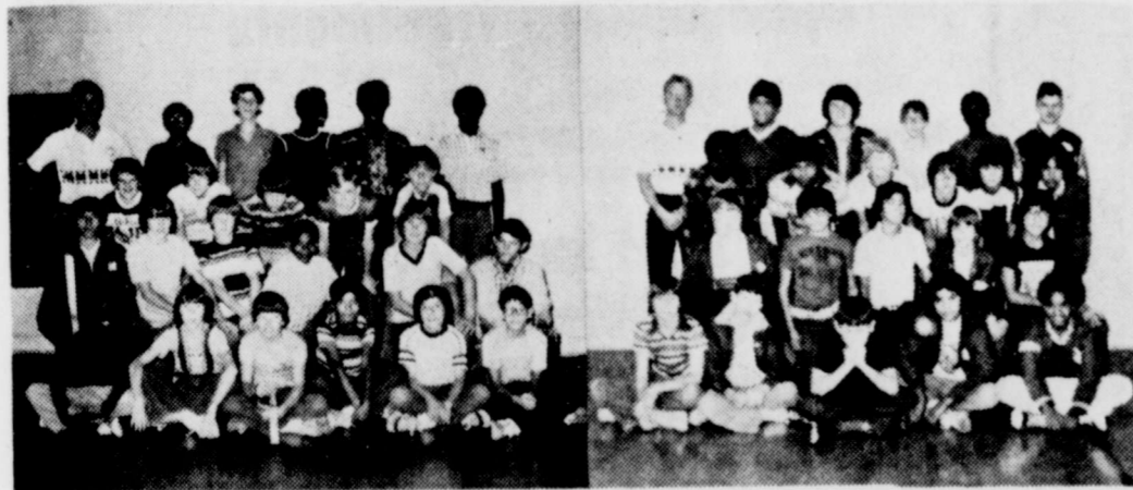
WE'RE THE CHAMPS! Could be the cry of the 7th grade football team as they went undefeated during the 1979 season.