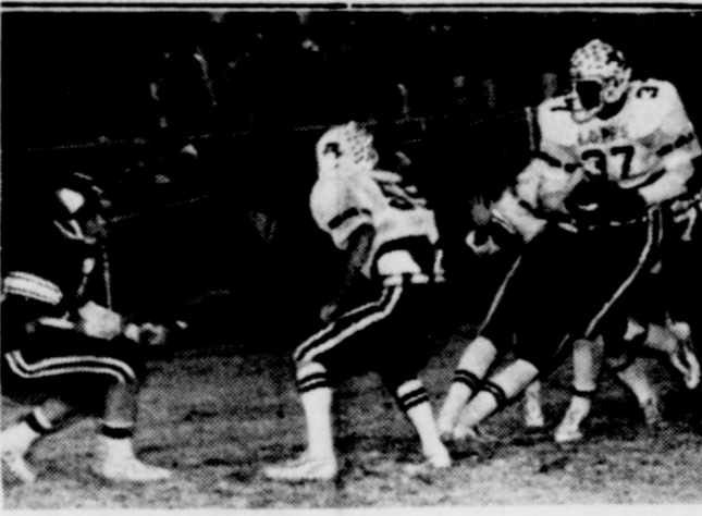
TIGHT END WILLIE BETTS (37) picks up good blocking, including Dana Flud (55) during action last Friday night at Floydada. The Lopes won the final regular-season game, 36-0.