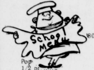
Pop 1/2 pt. Milk

Thom Pearson: 24 years experience on submersible pumps