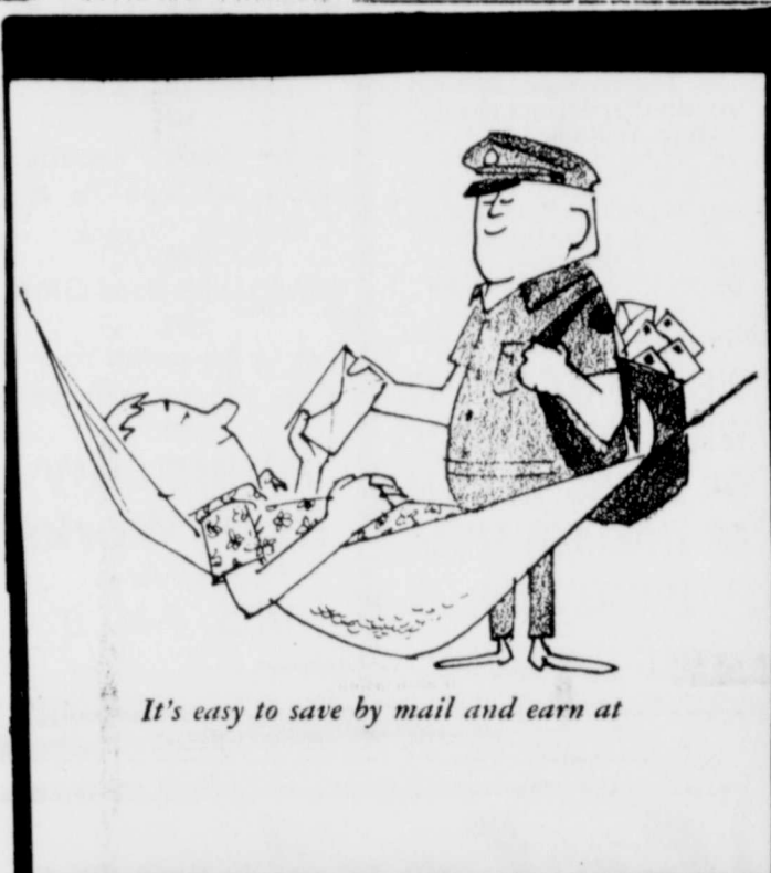
It's easy to save by mail and earn at

Do you have a question or a comment about drugs? Write: Texas Alcohol Narcotic Education, (TANE) 6778 Greenville Avenue, Dallas, Texas 75231