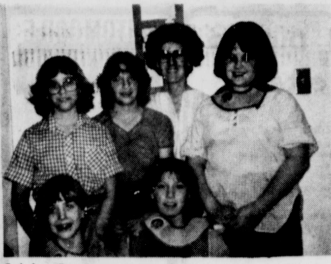
G. A.'s at First Baptist Church receive awards Wednesday night