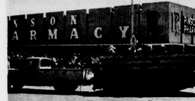
BAPTIST PUPPET FLOA won the second prize with their float.