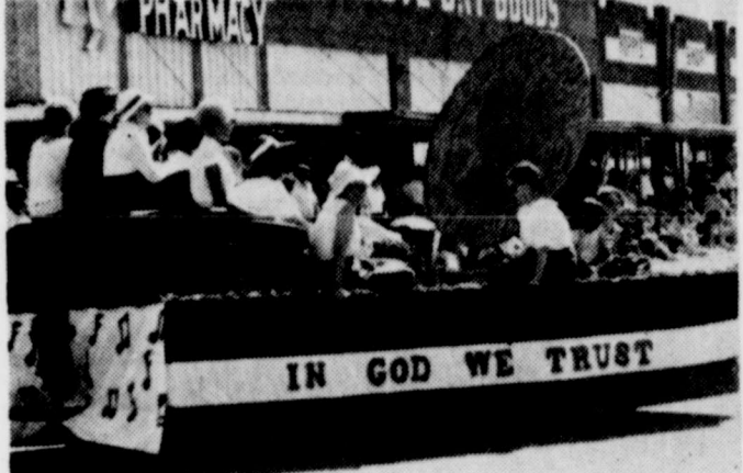
WINNING FLOAT: 1st Place Float was the Music Club.