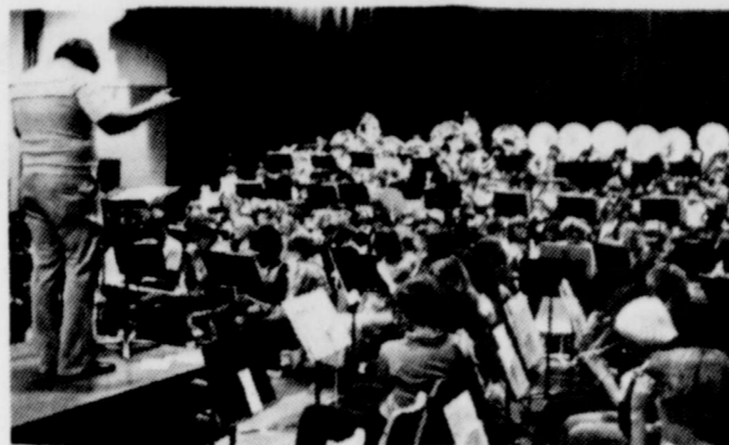
High school band members prepare for KAMC-TV's Christmas for the Kids' concert held Saturday (Dec. 6). More than 600 band members from across the South Plains including Abernathy participated in the concert