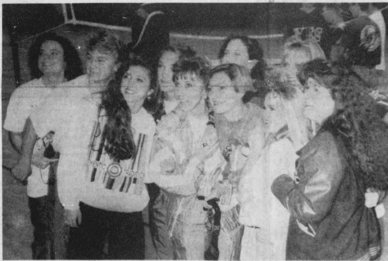
SENDOFF-the Prairiland Lady Patriots Volleyball team received a big sendoff when they left for

So, clip the coupon in the big ad in the paper and save money and make your Christmas giving easy and fun...and be sure to put yourself on the list! Remember, no notices will be sent at the beginning of the month because of the enormous volume of renewals during the sale.