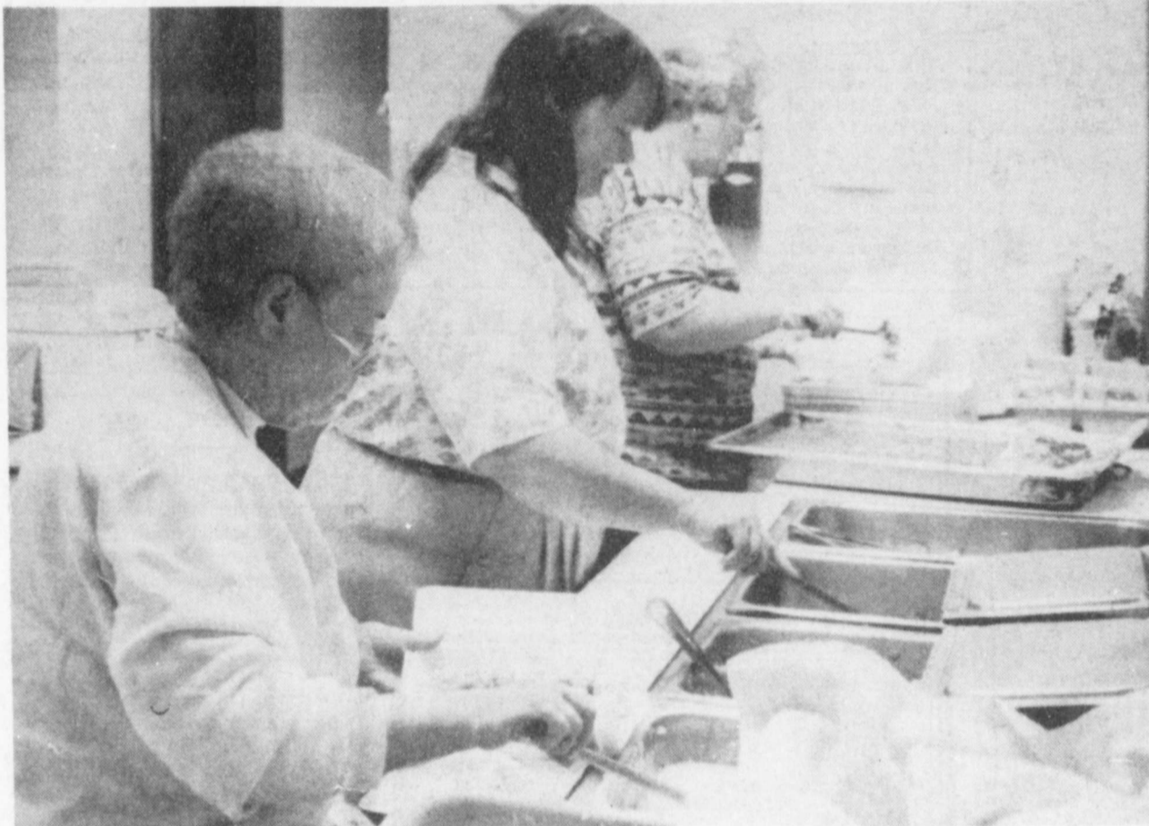
TURKEY AND DRESSING and all the trimmings was the order of the day Saturday as a large crowd attended the De-