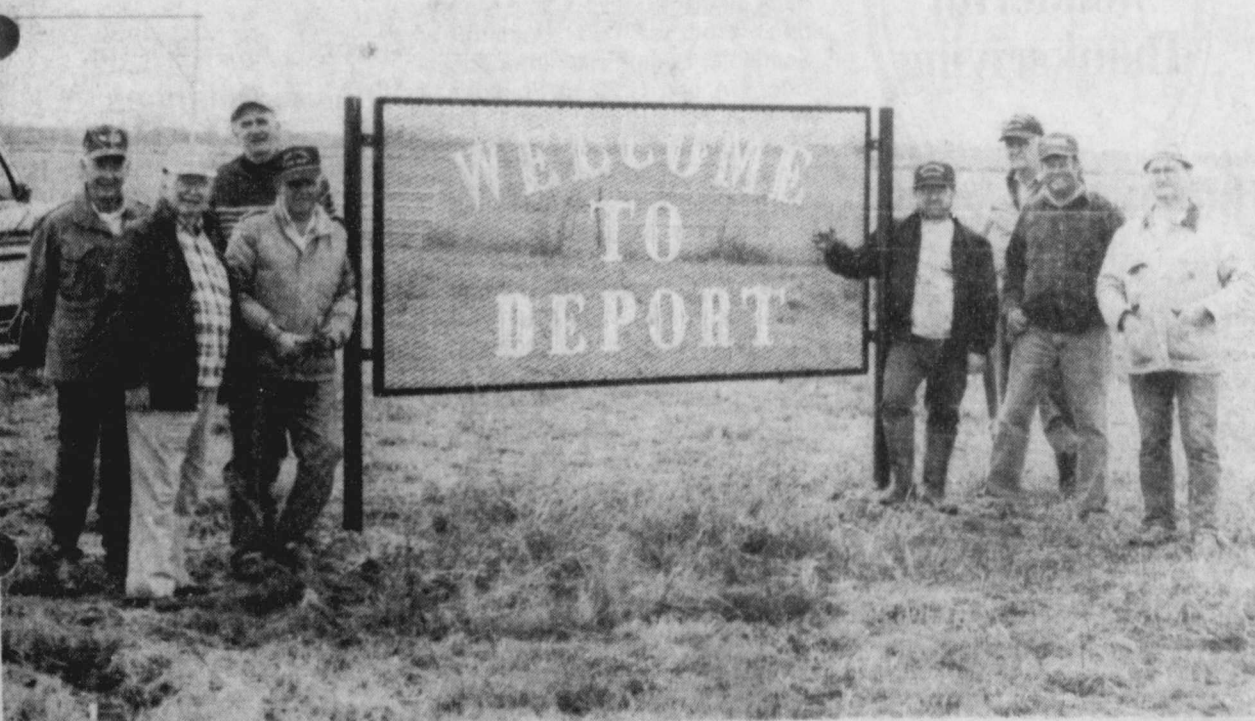
A BIG DEPORT WELCOME! Members of the Deport Community Service Club finished

The Pattonville Community Center and Volunteer Fire Department will hold an arts and crafts bazaar along with a bake sale and garage sale on Saturday, December 5 beginning at 9 a.m.