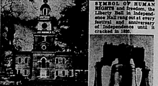
SYMBOL OF HUMAN RIGHTS and freedom, the Liberty Bell in Independence Hall rang out at every festival and anniversary of Independence until it cracked in 1835.

BIRTHPLACE OF OUR NATION was Independence Hall, Philadelphia, where Continental Congress met. Declaration of Independence adopted and proclaimed, Washington appointed Commander-in-Chief, and U. S. Constitution framed.