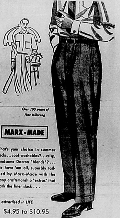
Over 100 years of fine tailoring