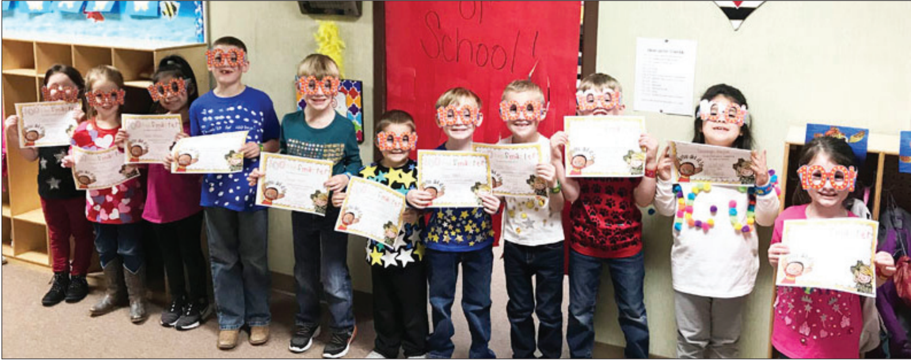
Fort Elliott Kindergarteners are 100 days smarter!