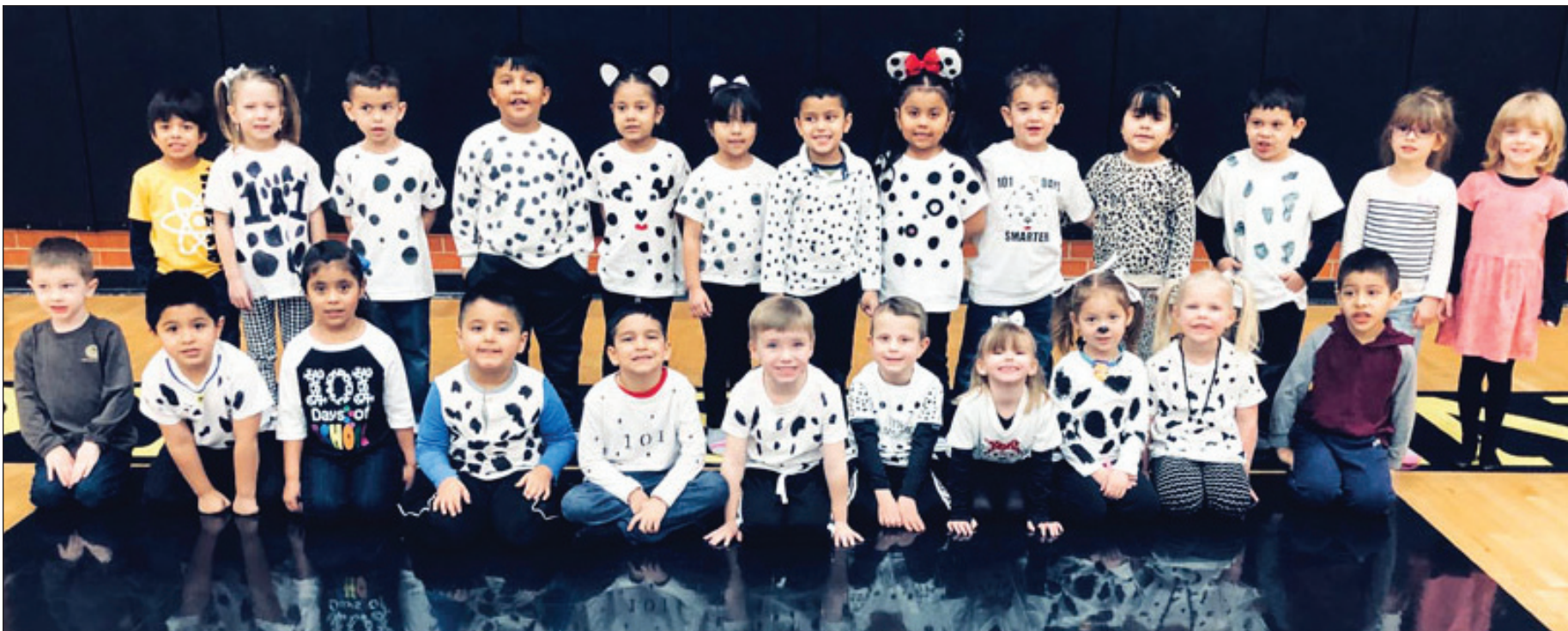
Wheeler's Pre-K dressed up as 101 Dalmatians to celebrate being in school for 101 days!!