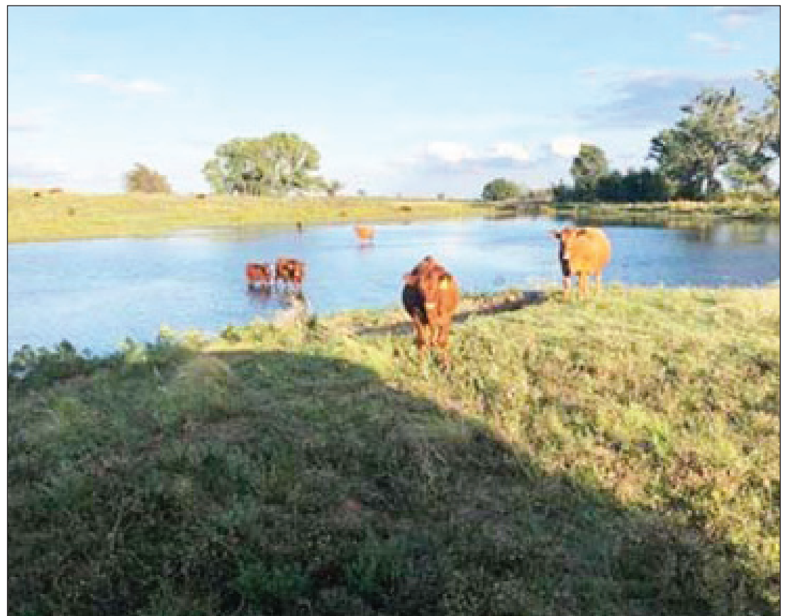
Hyland Weaver posted this picture on Facebook.