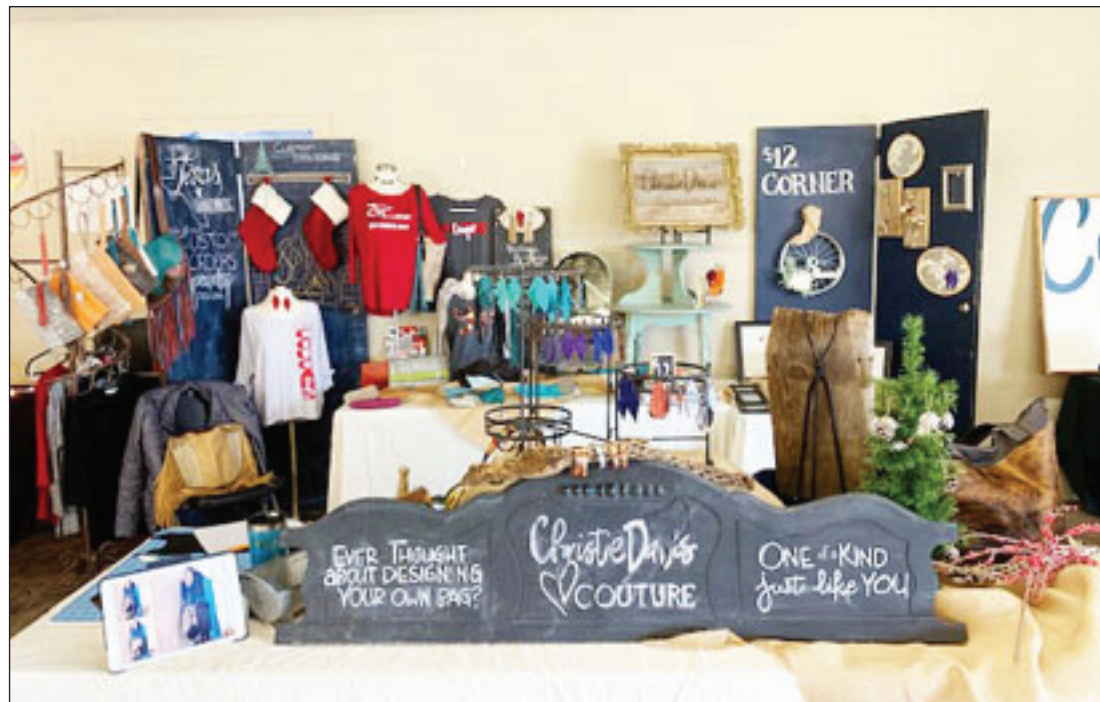
This is an example of what will be available Saturday, June 20, 2020 on the square.

The Panhandle Handmade Market is where you can find one of a kind treasures and Artisans. You can custom