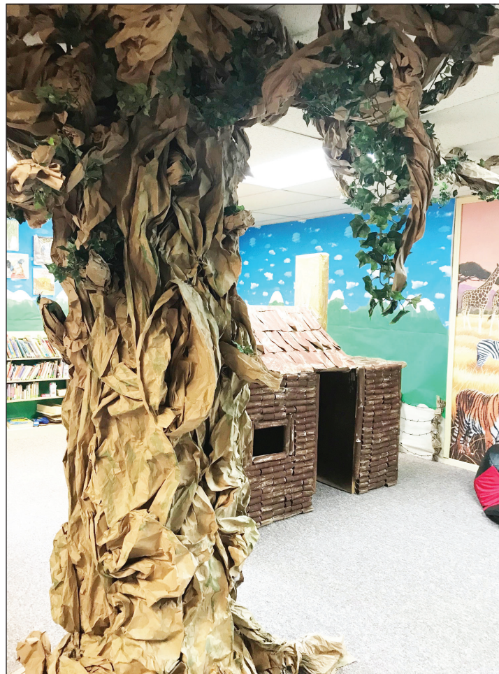
Wheeler Library Tree and Log Cabin

10-31-18, Sec. 53, Blk. A-7, H&GN Ry. Company Survey.