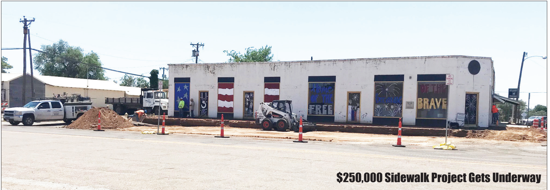
$250,000 Sidewalk Project Gets Underway