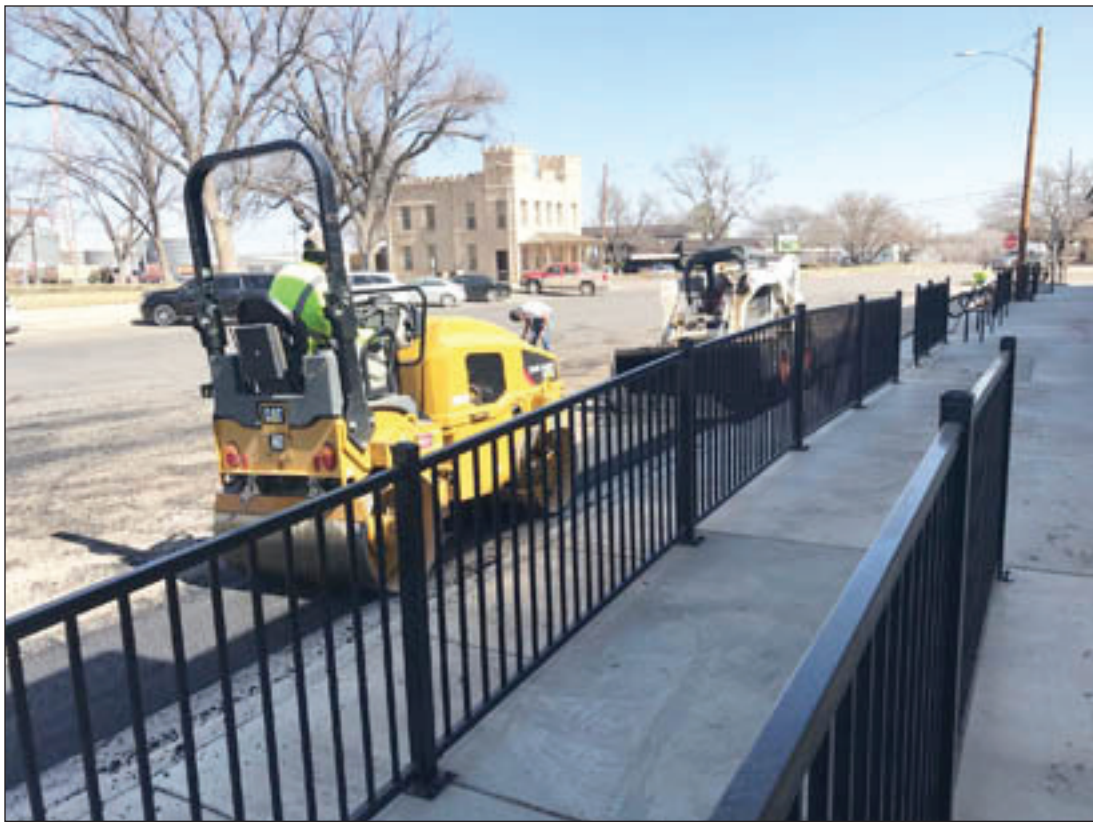
FINISHING TOUCHES: The asphalt was pressed into place last Thursday, as the finishing touches are added to the Texas Street Sidewalk Project.