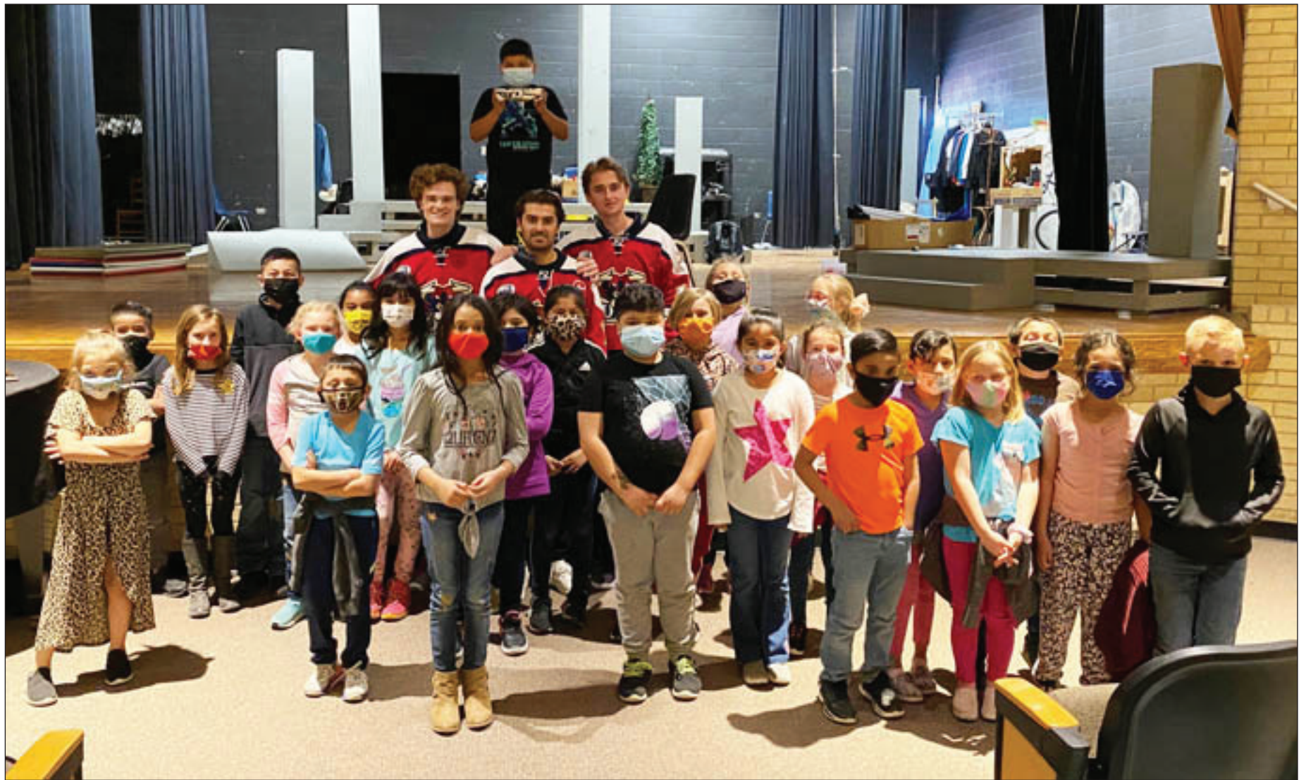
The Wheeler ISD was excited to see the Amarillo Bulls Hockey players on campus. The players spoke to the students about the importance of nutrition, sleep, and exercise. They also demonstrated how to play hockey and had audience participation. The Wheeler Mustangs are excited to cheer for the Amarillo Bulls this season. The Wheeler second graders are shown here with the hockey players.